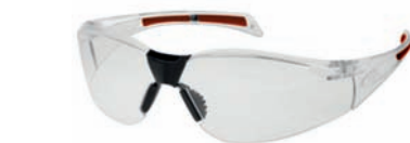
Stealth 8000 Clear