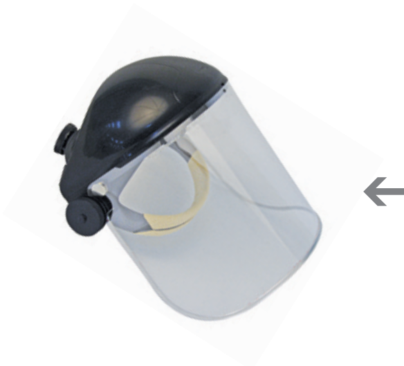
Invincible® Black Browguard Polycarb Bound (8"/20cm) AFA061-131-100

Ear Defender SNR=30 Ear-Defender conforms to EN 352-1 SNR 30. Visor conforms to EN1731