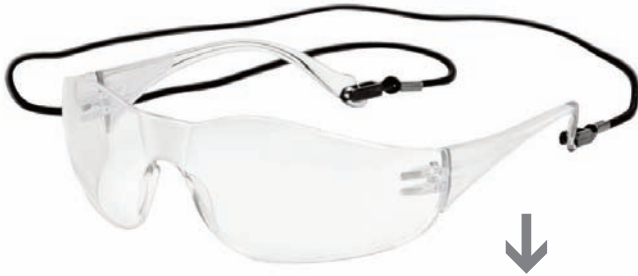
Stealth Hybrid™ ASA450-151-102

Stealth Hybrid™ offers eye protection in the form of a safety spectacle as well as safety goggles. With side arms attached the Stealth Hybrid™ is a safety spectacle providing protection to 1F standard and with the strap attached it is a safety goggle providing protection to the 1B standard. Both offer protection from UV, as well as increased dust and airborne particles compared with a standard safety spectacle.