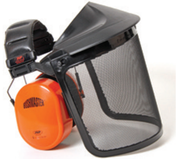
Bushmaster™ Classic Extreme Ear Defender c/w 20cm Wire Gauze Visor

Browguard with grey/unbound polycarbonate visor and elasticated headband. Conforms to EN 166.1.B.3.99