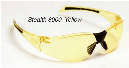
Stealth 8000 Yellow

Contour design and flexibility of frame gives a good versatile fit onto both smaller and larger faces. Extremely light and comfortable, Stealth7000 safety spectacle has been tested and approved to EN166 1.F.T (K or N ) protection together with EN170 - UV Ultra Violet ray filters or EN172 - Sun filters for industrial use.