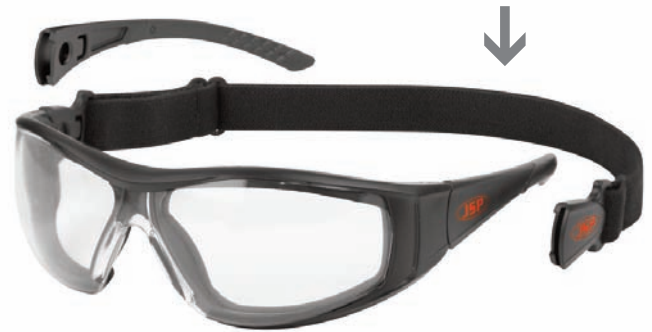
Stealth 7000 ASA430-021-300

The Z4000™ is a clear framed spectacle with an Anti-Mist HC Lens. An exceptionally lightweight sports style safety spectacle, with a wraparound Polycarbonate lens with UV protection and an integrated nose-bridge. The Z4000™ includes a simple to attach/detach spectacle cord for convenience and prevention of misplacement.