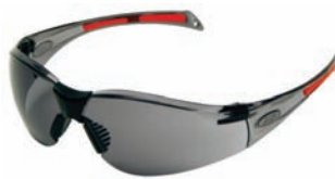
Stealth 8000 Smoke