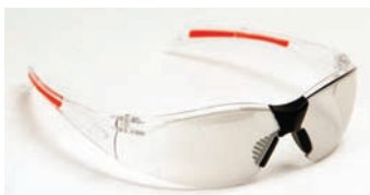
Stealth 8000 In-Out