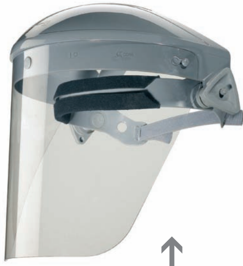
Martcare® Faceshield AFM061-230-400

Browguard with grey/unbound polycarbonate visor and elasticated headband. Conforms to EN 166.1.B.3.99